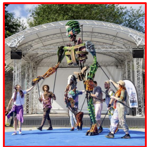
Image: Autin Dance Theatre's Out of the Deep Blue

In Drama, we are drawing inspiration from the dance performance "Out of the Deep Blue" by Birmingham's Autin Dance